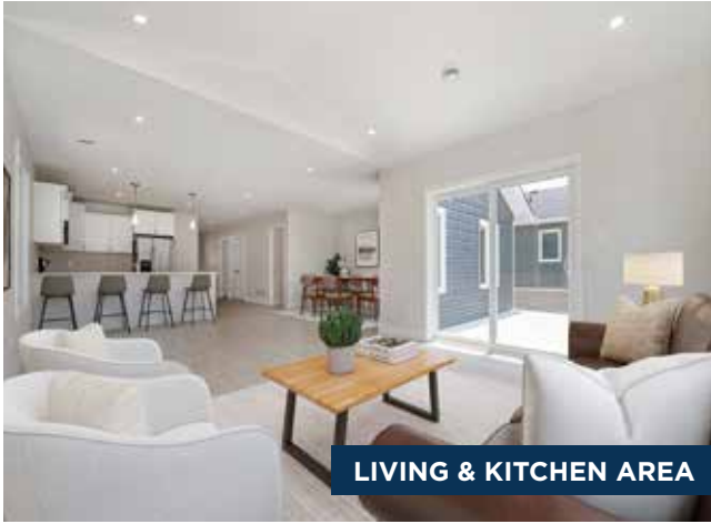
LIVING & KITCHEN AREA